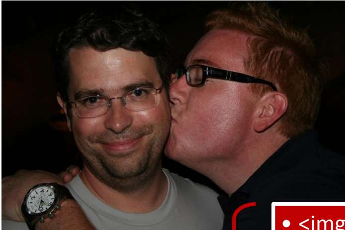
Image File Name Optimization

Another factor search engines use is the image file name. Using an image file name that is descriptive will help the search engines know the contents of your image. Be sure to separate words with hyphens and keep the image name less than 5 words long to avoid spam flags.